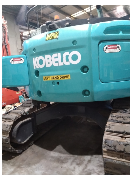
Tyre Condition 4