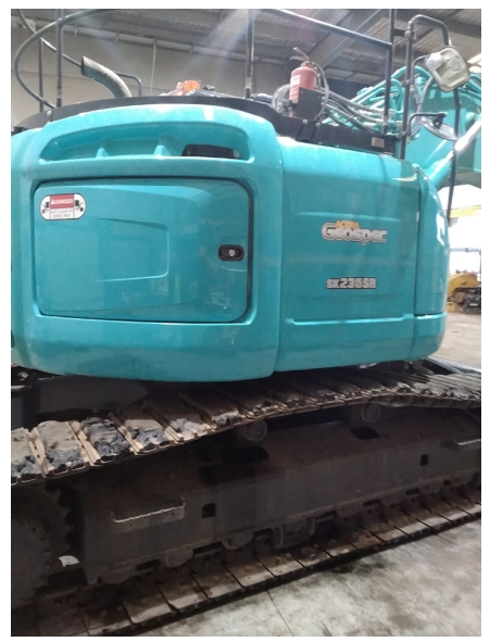
Tyre Condition 3